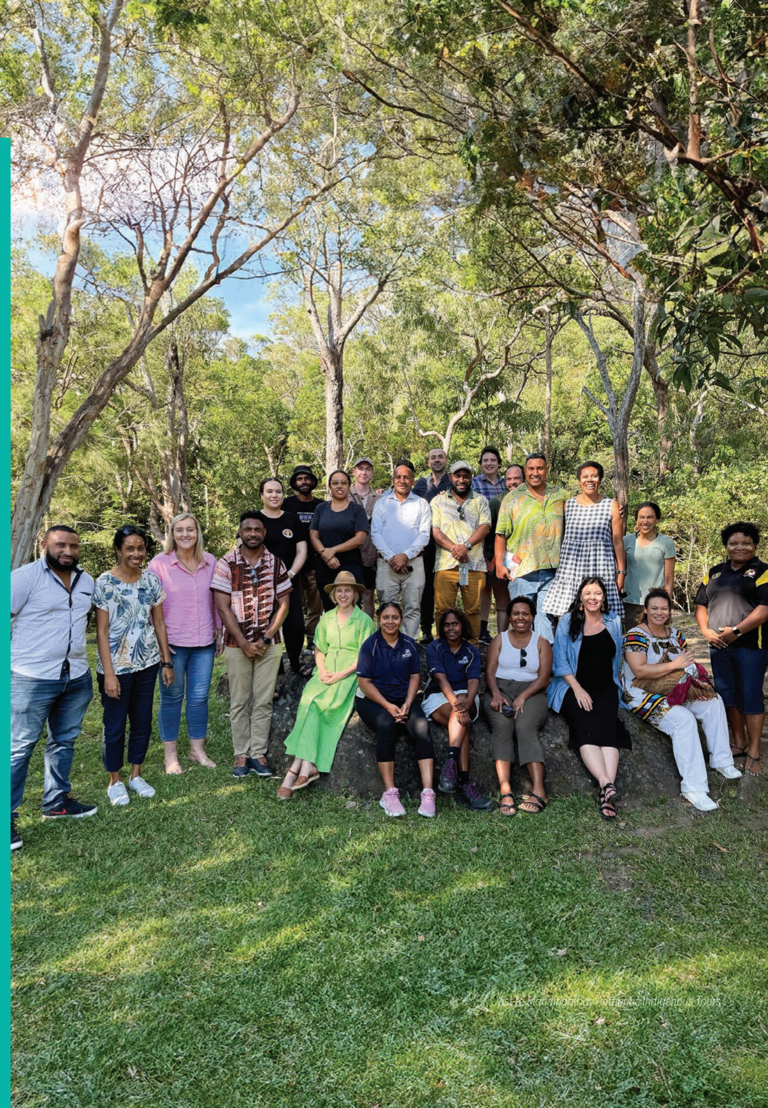
Visit to Mandingalbay Authentic Indigenous Tours

The success of traditional owner and ranger programs in Australia can be a model for PNG. Australian support for ranger programs in PNG, such as in Western Province and Kokoda, demonstrates the potential for expanded dialogue and training opportunities in community resource management, environmental protection, and biosecurity. Events and conferences where PNG rangers can share insights and learn from Indigenous Australian ranger programs would be invaluable for exchanging traditional knowledge and practices.